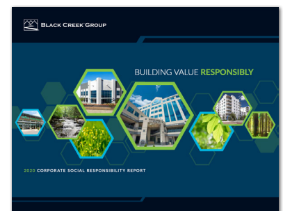
Black Creek Group 2020 CSR Report