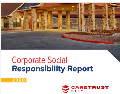
CareTrust REIT 2020 CSR Report

Click below to view examples of our clients' corporate social responsibility reports: